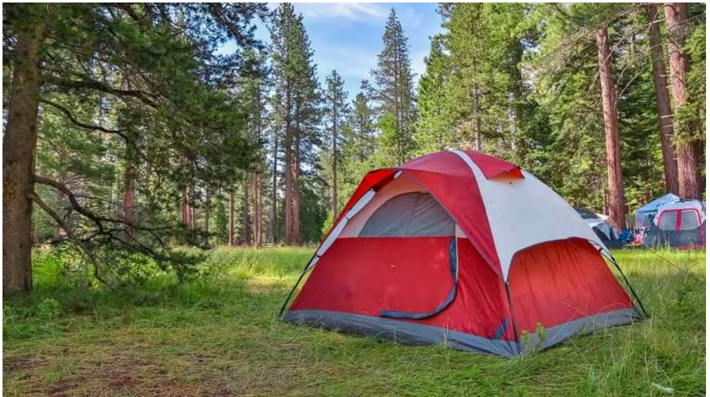
The Land Camping Area